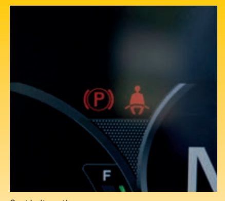
Seat belt caution