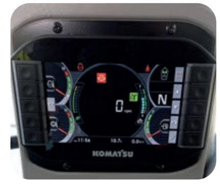
7" multi-function monitor