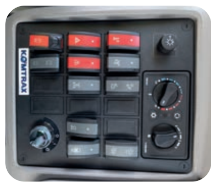
Ergonomically designed switches