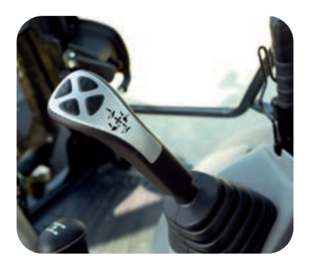
Convenient, ergonomic and precise control

A high-definition 7" LCD monitor provides excellent visibility. The high-definition LCD panel is less affected by the viewing angle and surrounding brightness, ensuring excellent visibility. Various alerts and machine information are displayed in a simple format. Useful information such as operation records, machine setting and maintenance data are also provided. The operator can easily navigate through screen pages with intuitive side buttons.