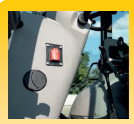
Secondary engine shut down switch