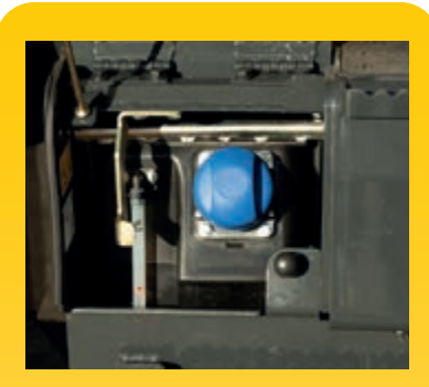
AdBlue<sup>®</sup>, fuel and hydraulic oil tank are easily accessible on the machine side and refilled by ground level, ensuring a fatigue less operation

When you purchase Komatsu equipment, you gain access to a broad range of programmes and services that have been designed to help you get the most from your investment. For example, Komatsu's Flexible Warranty Programme provides a range of extended warranty options on the machine and its components. These can be chosen to meet your individual needs and activities. This programme is designed to help reduce total operating costs.