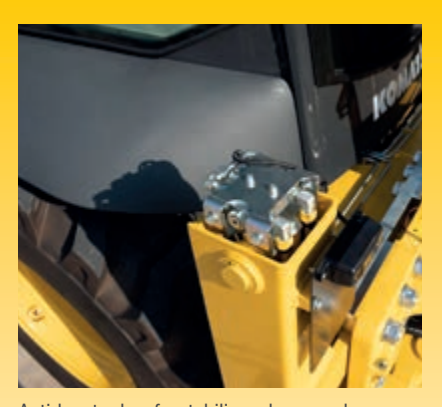
Anti-burst valves for stabilizers, boom and arm (Standard)