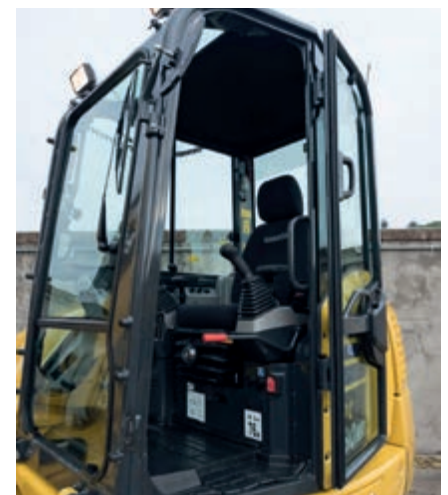
New hinged door for increased accessibility