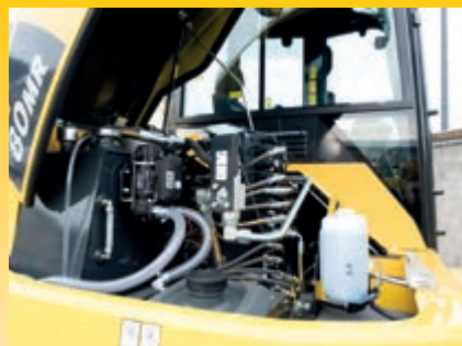
Enhanced service access