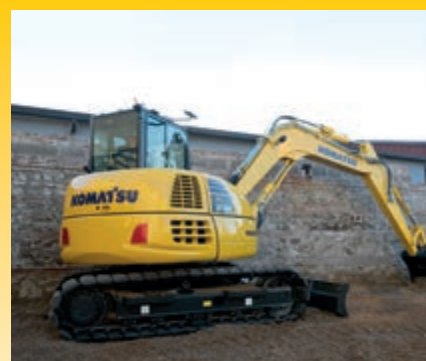
A reduced front swing radius and boom swing function make trench digging a cinch