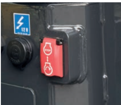
Secondary engine shut down switch