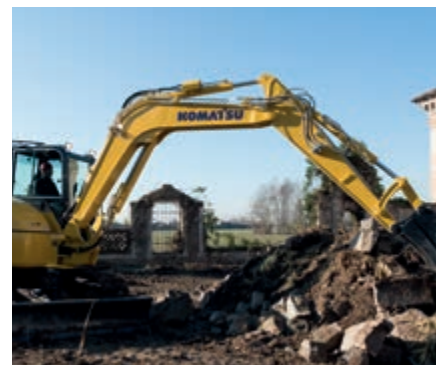
Hose burst valves on boom and arm cylinders