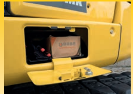
Generous storage compartment under the cab