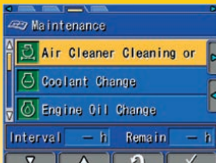
The multifunction monitor panel with maintenance and service information