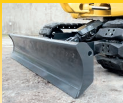
New, improved blade design