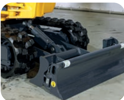
Foldable blade to match the variable undercarriage gauge