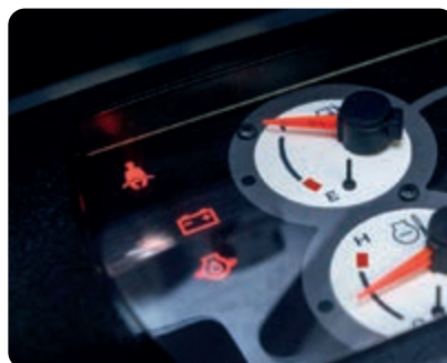
Seat belt caution indicator on the dashboard