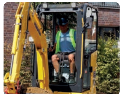
Large glass surfaces provide an excellent all-round view on the job site