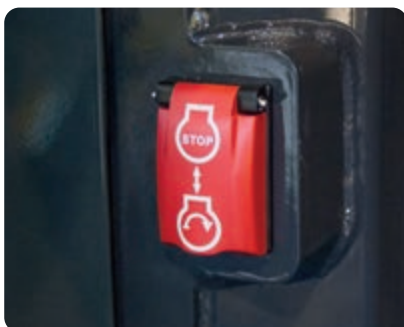
Secondary engine shutdown switch