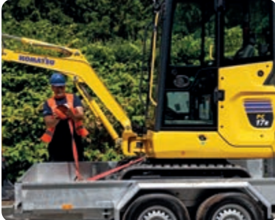
Tie down points on upper structure help to quickly secure the machine for transport