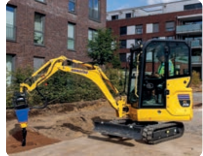
Perfect control even during combined operations