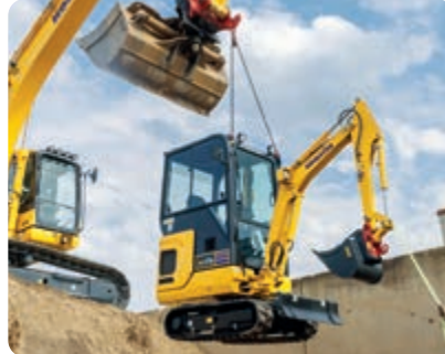
Fast and simple lifting using ropes only, without any additional tools required