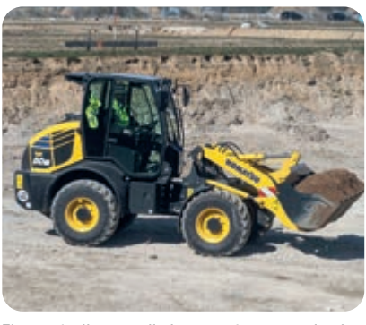
Electronically controlled suspension system load stabilizer (ECSS) (option)