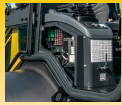
Side cover for quick maintenance access