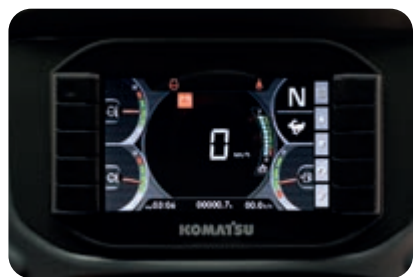
Large multi-function monitor

The user-friendly multi-function colour monitor with Equipment Management and Monitoring System (EMMS) supports safe and smooth work. Eco-gauge and an Eco guidance with active recommendations help maximising fuel savings. The monitor is conveniently customisable with a choice of 24 languages.