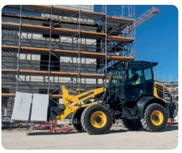
A wide range of buckets and attachments is available. Your Komatsu distributor is ready to assist you with the selection of suitable options.

This specification sheet may contain attachments and optional equipment that are not available in your area. Please consult your local Komatsu distributor for those items you may require.