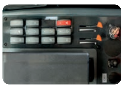
Improved, ergonomic control elements